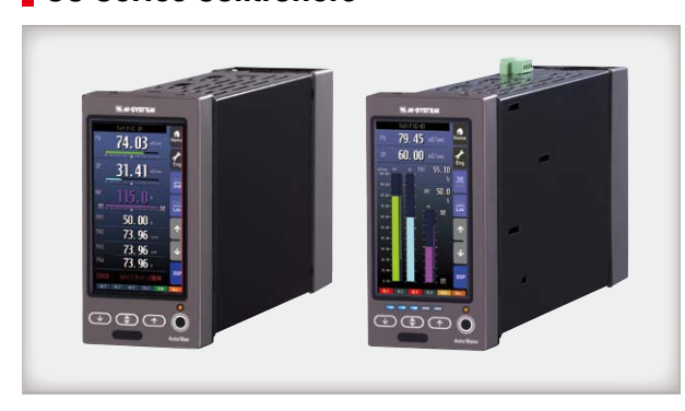
$C100: Basic version $C110: Basic version with manual loader $C200: Modbus / NestBus $C210: Modbus / NestBus extension version