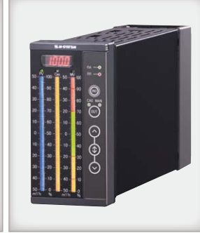
SC110: Basic version with manual loader SD10: 3-channel Bargraph Indicating Alarm SM10: Manual Loader