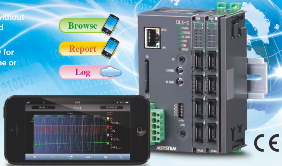
Web-Enabled Remote Terminal Unit for Monitoring, Event Reporting and Data Logging Model: DL8